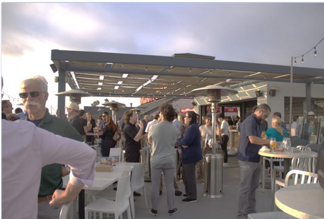
Good Food and Fun Times at the Summer Mixer