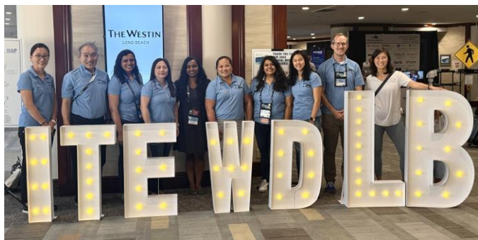
ITE Western District Conference Organizers

across the ITE Western District including from California, Oregon, Washington, Hawaii, and Alaska. Beginning on Sunday, the registration desk opened, and exhibitors were able to go to the exhibit hall to set up their booths. Various vendors attended the event including Western Systems, Miovision, NexTech Systems, Econolite, SWARCO, Advantec Consulting Engineers, Iteris, Etherwan, Kimley-Horn, NoTraffic, Tomar, Q-Free, CTWest, Counts Unlimited, and more. Exhibitors could be found in both the Centennial Hall and in front of it, showing off their products, services, and any recent projects they had worked on. Sunday night ended with a social hour for all to attend.