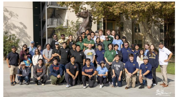
Traffic Bowl Participants