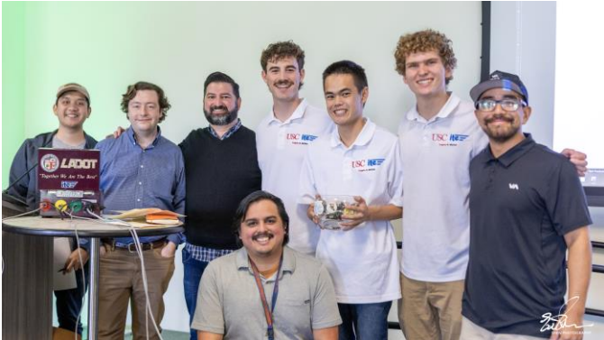
Champions: USC ITE

The third round was a nail-biter that went into final jeopardy with the home team in the lead and USC ITE closely behind. However, USC ITE turned the tables on the final clue to finish on top.