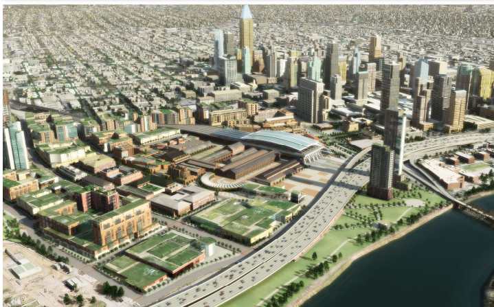
Sacramento Station Area Development – (Photo Credit: California High-Speed Rail Authority)

David M. Schwegel, PE (Precision Civil Engineering)