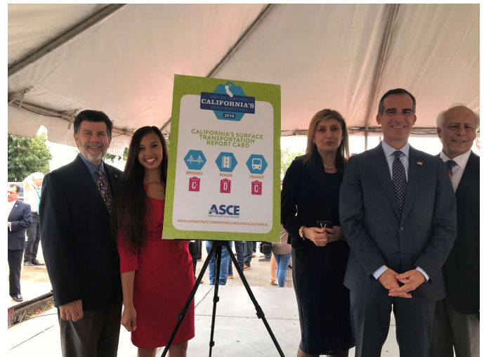
Press Conference near LAX for the Transportation Report Card Release with LA Mayor Garcetti and ASCE Board Members

The Los Angeles Release Event was held at a tent near LAX with views of the construction of the new Light Rail Line and Automated People Mover that will serve LAX. Attendees included elected officials, members of the Fix Our Roads Coalition with hard hats holding "No On 6" signs, infrastructure professionals, and around a dozen news outlets.