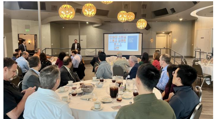
November business meeting attendees.