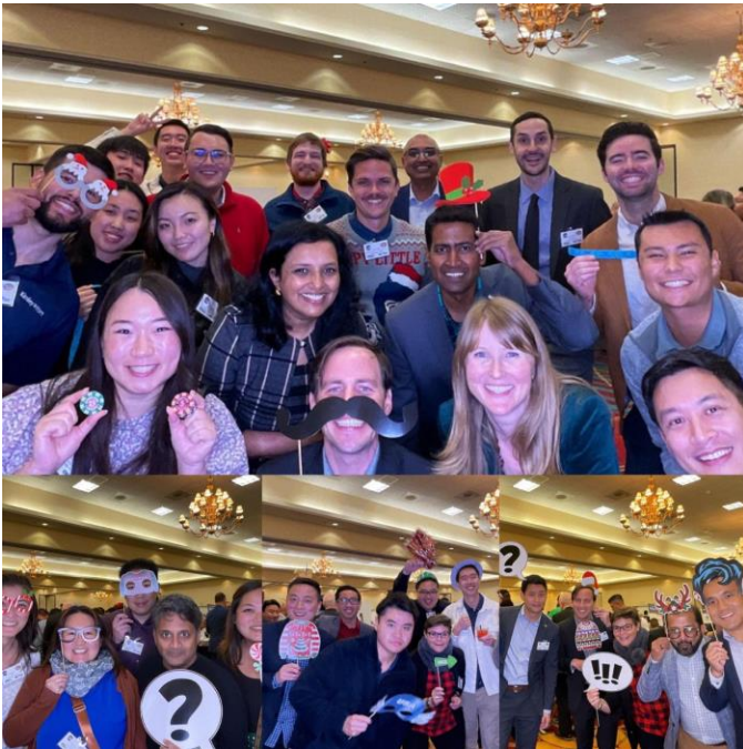
A portion of the 2023 Holiday Mixer attendees

California, and beyond. In addition to catching up and reflecting back on a great 2023 with colleagues, the event included Casino Night activities, photobooths, and thousands of dollars worth of raffle prizes. To increase your chances of winning, additional raffle tickets were sold with those proceeds going directly to Transforming a Life's Jacket Drive for the Homeless Charity. Thank you to all that attended and special thanks to the event organizers for putting on such a great joint event!