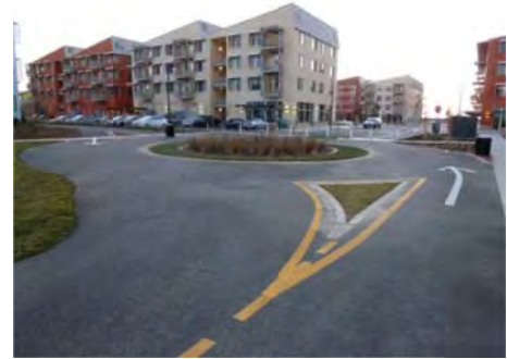
A Bike Trail Roundabout

Notably absent in this community are traffic signals. Motorists travel through two roundabouts. Cyclists also have a roundabout.