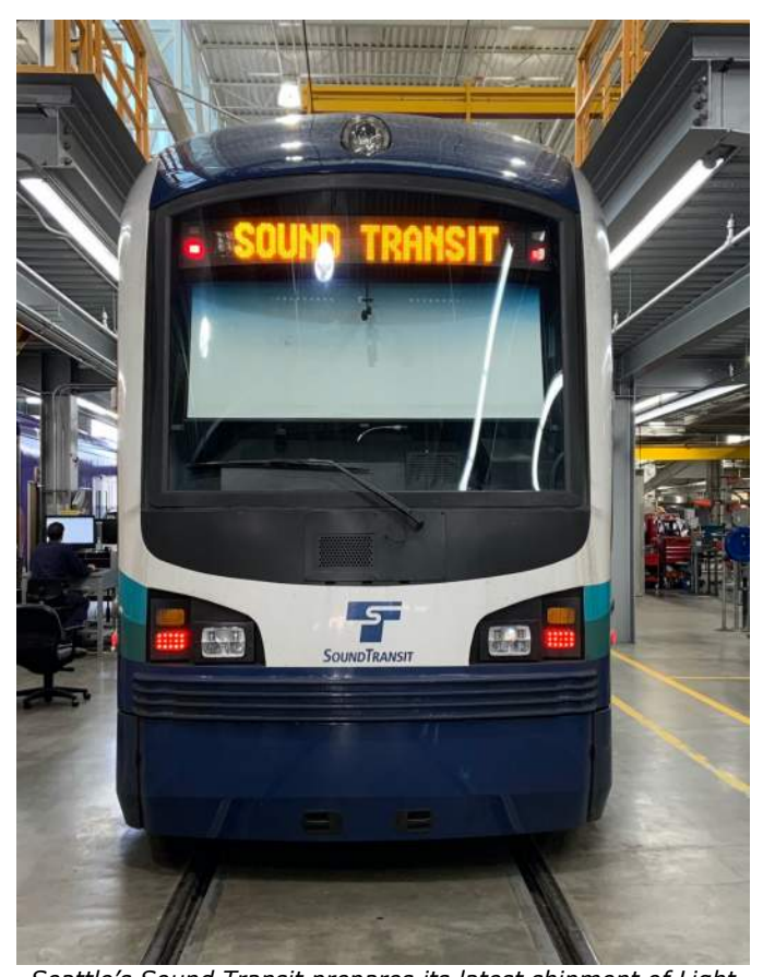
Seattle's Sound Transit prepares its latest shipment of Light Rail Vehicles from Siemens in Sacramento for deployment on the East Link Extension along I-90 across Lake Washington – the world's first application for making Light Rail work on a floating bridge.

Ask Barry Broome and Malcolm Gladwell about the relationship among quality transit rolling stock, economic stimulation, and crime reduction. You'll likely hear success stories of Seattle's state-of-the-art light rail rolling stock and the region's phenomenal economic performance (62 construction cranes in Seattle in 2016 versus 0 in Sacramento), frustration stories of Sacramento's deteriorating rolling stock and the loss of perspective employers based on a single experience on SacRT following months of "wining and dining" by GSEC, and the observation of boosting the aesthetic appeal of rolling stock and cracking down on fare evasion on the New York Subway System and the corresponding significant drop in crime in the "Big Apple".