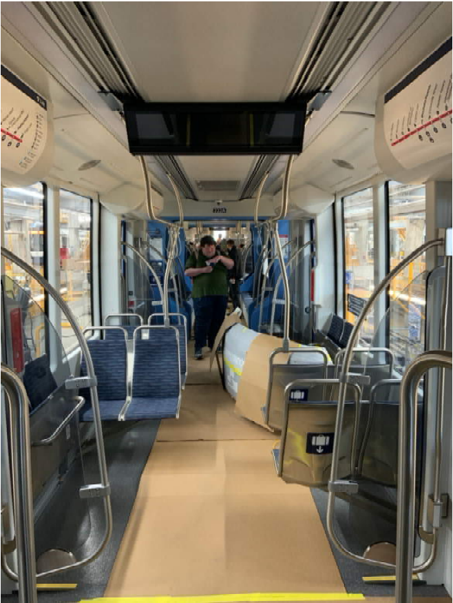
As an incentive to get commuters to take Link Light Rail instead of driving in "bumper to bumper traffic" on I-90, the next-generation Light Rail Vehicles will offer large windows with "breathtaking views" of Lake Washington. Seattle has by far the nation's highest per capita spending on transit. Seattle has also seen the nation's highest transit ridership growth between 2011 and 2018 while Sacramento saw the nation's largest decline.

Governor Christine Gregoire's dual observations that economies are now competing Mega-Region to Mega-Region, and the Cascadia Mega-Region prides itself in doing what other Mega-Regions "can't, won't, or are otherwise unwilling to do".