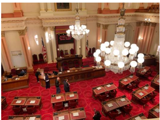
Inside the Senate Chambers in the Capitol

apportionment of funds for road repair and maintenance. The bill would establish apportionment formula, identify quaranteed minimum apportionments, and establish the types of eligible projects consistent with specified requirements, which would be submitted in list form by local and regional transportation agencies to the commission. (Status: Vetoed by Governor Newsom on October 12, 2019. In Senate under pending consideration of Governor's veto)