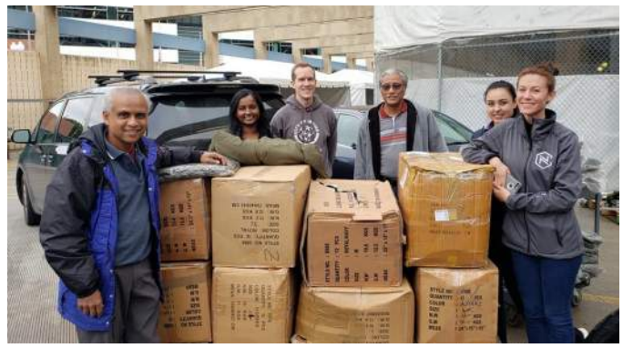
ITE SoCal Members participate in the Jackets for the Homeless Project in Santa Ana

ITE SoCal kept our friends in need warm at the Courtyard Shelter in Downtown Santa Ana. It was a wet cold morning December 7<sup>th</sup> but the jackets provided by <a href="https://www.transformingalife.org">www.transformingalife.org</a> will help in the following winter months.