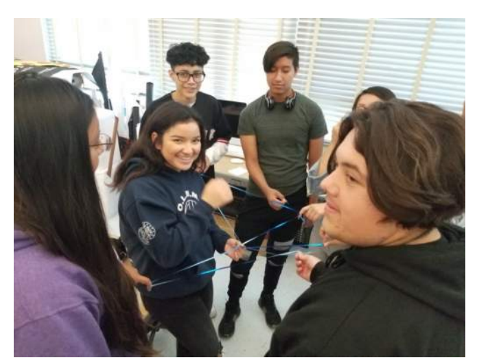
Students enjoy an exercise illustrating transit routes at the recent STEM Outreach Event.

Each class involved a presentation about Civil and Transportation Engineering that used the concepts the students were learning in their math and science classes to relate their experience with the Engineering field, such as how the simple kinematic equations they have learned get used by engineers to time signals. Students learned about the wide variety of engineering right outside their door as we took a virtual tour of the intersection outside, from signing and striping to signal detection.