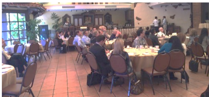
Figure 1: Attendees Watch a Workshop Presentation

The Institute of Transportation Engineers Southern California Section (ITE SoCal) held a joint workshop with the San Diego Section on Friday, March 20, 2015 at the El Adobe De Capistrano Restaurant in San Juan Capistrano. There was a great turnout, with members from both chapters being well represented in addition to the student chapters from Cal Poly Pomona and San Diego State University. The workshop included a number of insightful presentations that captivated the audience's attention and triggered thoughtful discussions and questions.